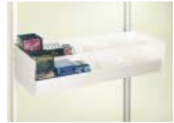
Two-Tier Multimedia Browsing Box Divider type – each 36" wide (914 mm) unit stores approximately 48 VHS or 110 CDs.