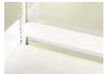
Offset Centerstop Eliminates the need for two independent shelf backstops. Can increase shelf depth by 1" (25 mm).