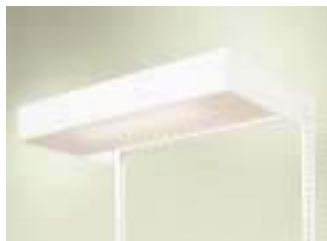
Canopy Light Illuminates display shelves and brightens dimly lit alcoves. Includes white prismatic diffuser.