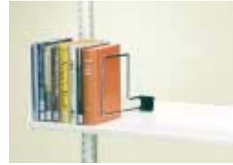
Integral Low-Back Dividers For low-back shelves, available in three sizes for five different shelf depths.