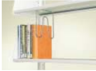
Snap-In Hanging Wire Support Available in four different sizes.