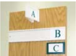
Aisle Identification Options Optional range finders and card holders make locating and reshelving of materials fast and easy.