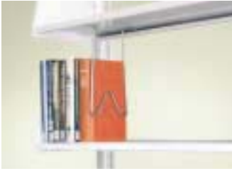
Hanging Wire Support Squeeze type, available in three sizes for five different shelf depths.