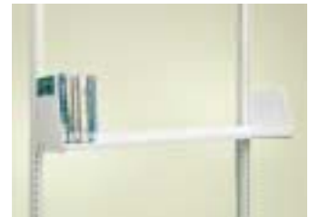
Sloped Adjustable Shelves With Integral Low-Back Shelf is sloped to aid viewing of displayed items. Unit is compatible with integral low-back dividers.