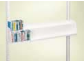
Two-Tier Audio Cassette Tape Shelf Each 36" (914 mm) shelf holds approximately 100 audio cassette tapes (50 per tier).