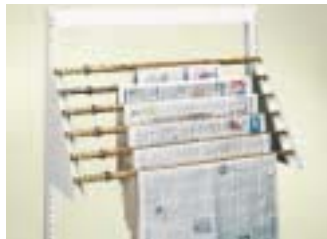
Six-Tier Newspaper Rack Efficiently displays up to six newspapers for easy identification and retrieval.