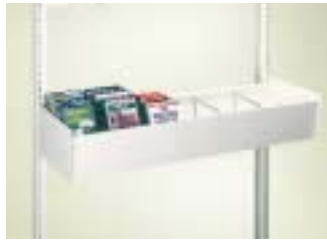
Multimedia Browsing Box Each 36" wide (914 mm) unit stores approximately 42 VHS tapes or 100 CDs.